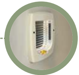
2 way locking CAT FLAP